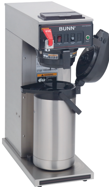
Model CWTF-DV APS shown with Airpot (Server sold separately)

Dimensions: 23.6" H x 9" W x 18.5" D (59.9cm H x 22.9cm W x 47cm D)