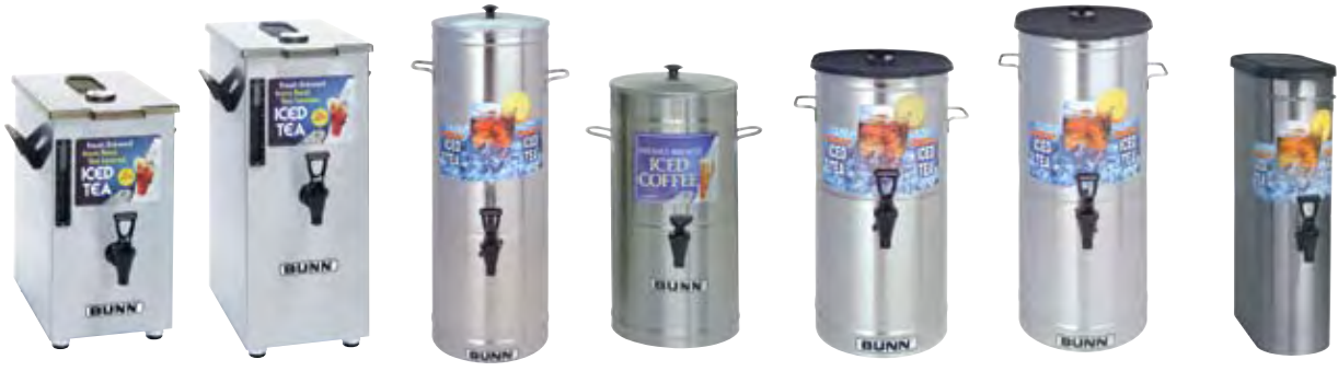
TD4 TD4T TDS-5 ICD-3 TDO-4 TDO-5 TDO-N-3.5