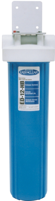
Model ED-12-HB Water Quality System