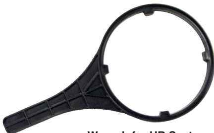
Wrench for HB System Product No. : 34135.0000

Warranty: BUNN warrants the Easy Clear® hardware (excluding cartridges) to be free from defects in materials and workmanship for 1 year from the date of installation. See service manual for complete warranty statement.